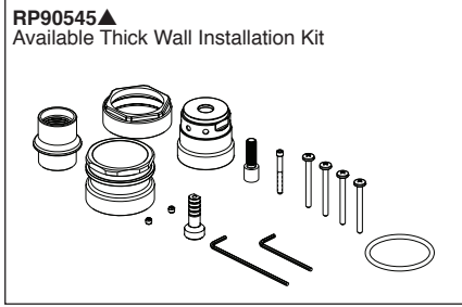
▲ Designate Proper Finish Suffix