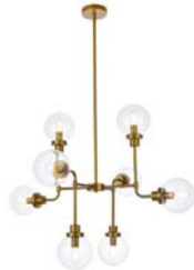
Brass Item No:LD7039D36BR