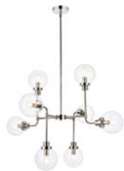
Polish Nickel Item No:LD7039D36PN