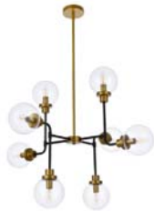
Black+Brass Item No:LD7039D36BRB