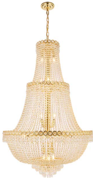
Gold Item No: V1900G30G