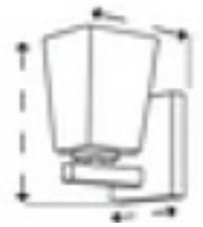
Image File Name: P5803-077.jpg