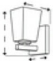
Image File Name: P5805-077.jpg