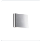
AT6506-BN Brushed Nickel