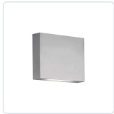
AT6606-BN Brushed Nickel