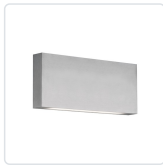
AT6610-BN Brushed Nickel