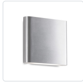
AT68006-BN Brushed Nickel