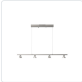
LP19937-BN Brushed Nickel