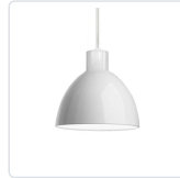
PD1709-WG Glossy White