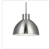
PD1709-BN Brushed Nickel