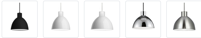
PD1712-BK Black PD1712-WG Glossy White PD1712-WH White PD1712-CH Chrome PD1712-BN Brushed Nickel