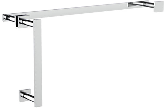
Offset Door Handle