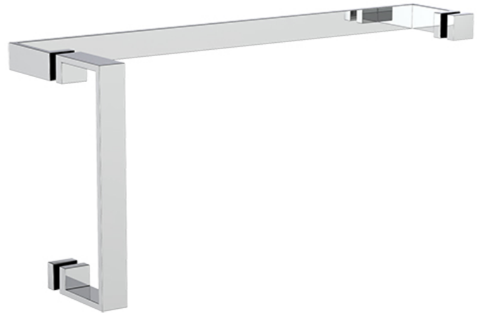
Offset Door Handle