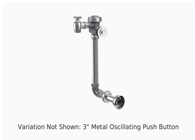
Variation Not Shown: 3" Metal Oscillating Push Button