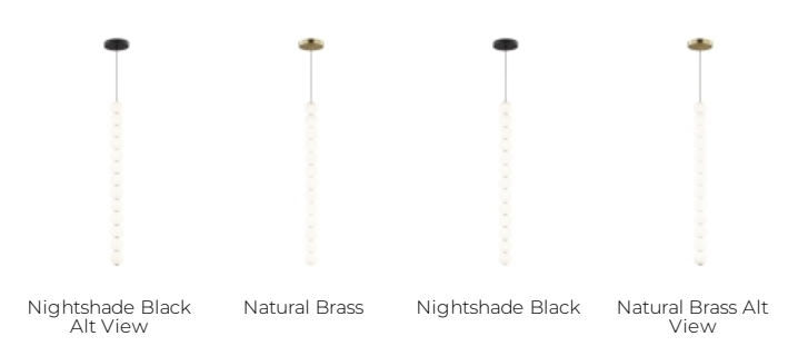
Nightshade Black Alt View

Includes 18.9 watts, 1196 total delivered lumens, 90 CRI 2700K LED modules. Dimmable with most LED compatible ELV and TRIAC dimmers. Ships with 12 feet of field-cuttable matte black cord. 120V-277V