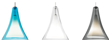
aqua clear smoke

SORAA® LED Bi-Pin Replacement Pendant Module, Swag Hook