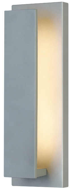
NATE 17 shown in graphite