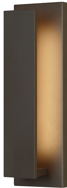
NATE 17 shown in bronze

* Visit techlighting.com for specific warranty limitations and details.